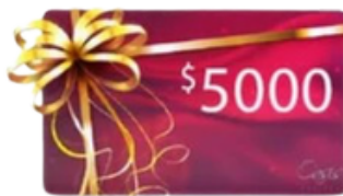
$5000 GIFT CARD